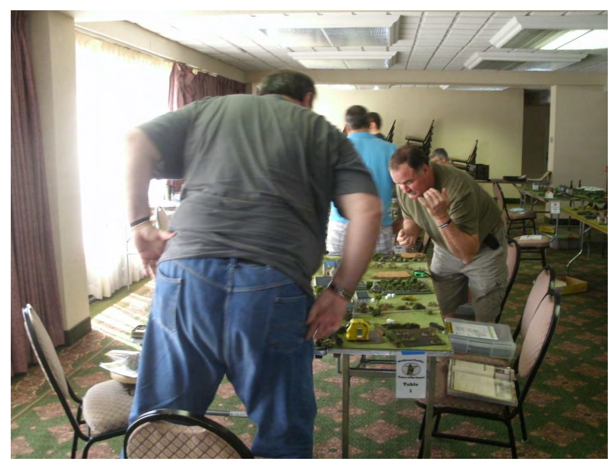
FOW Action At RAPIER 2014