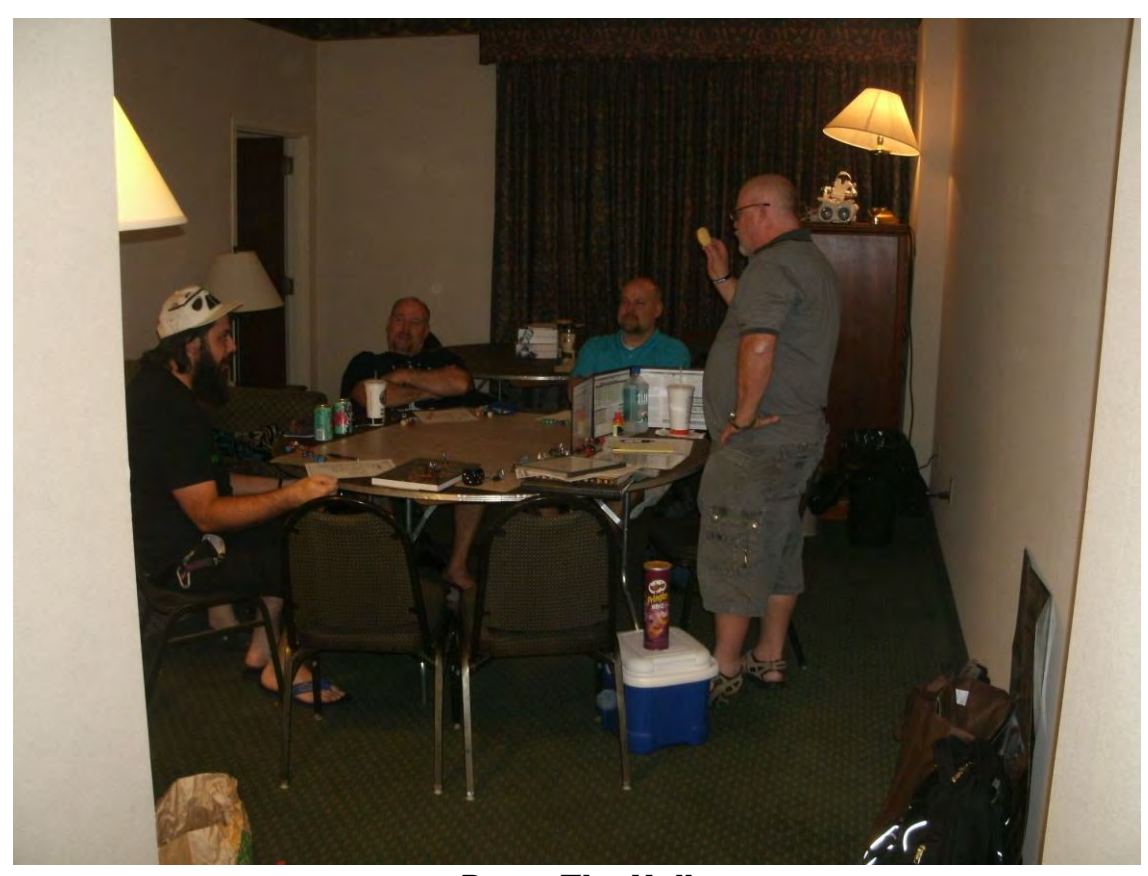
Down The Hall