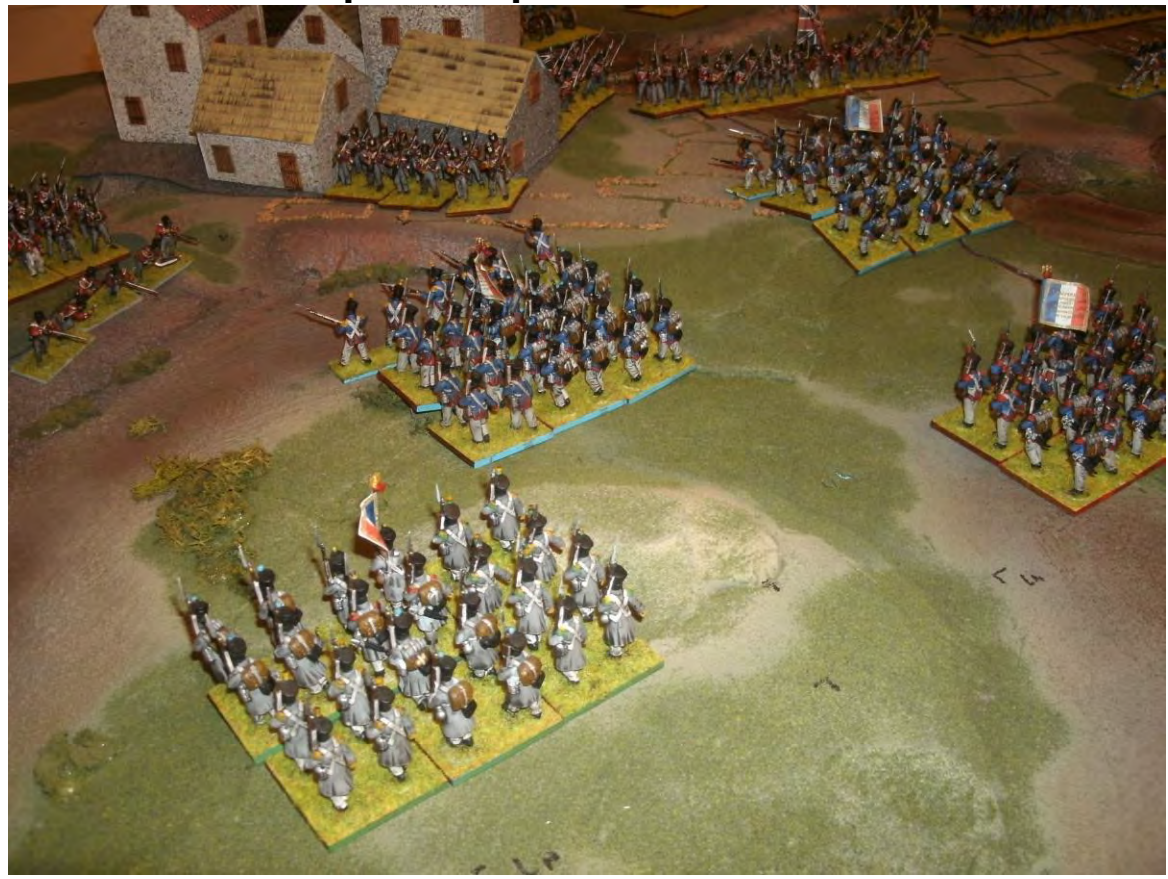
Boyd Bruce's Napoleonic Quickie Rules in 28mm