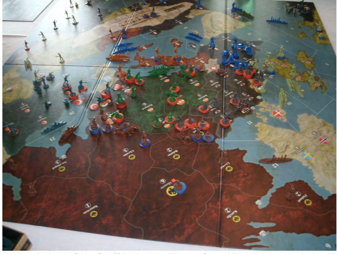
But It Was Mostly Dark Side Stuff-Including These Guys Who Forgot To Paint Their Toys