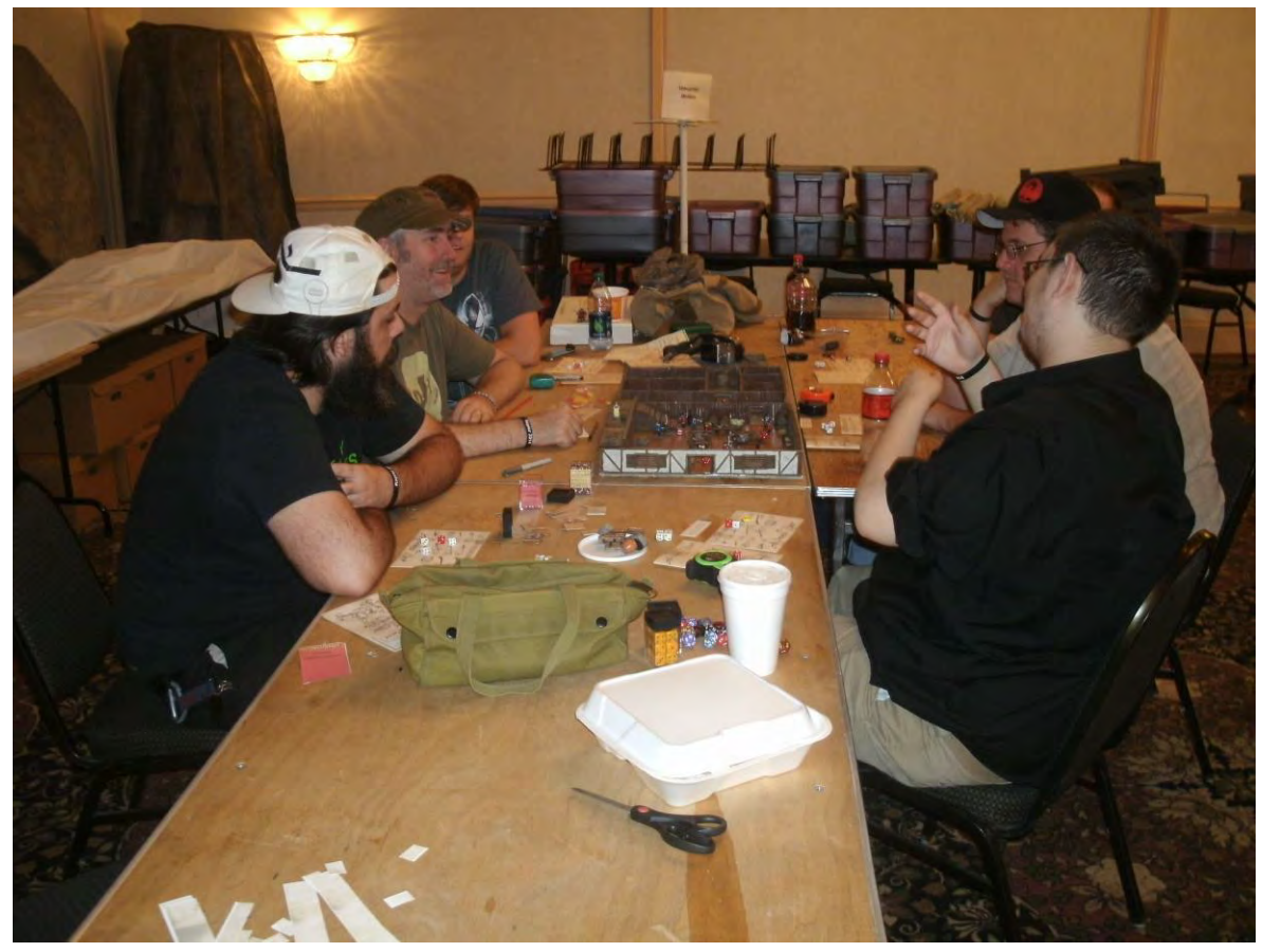
And DB Of One Kind Or Another Continued