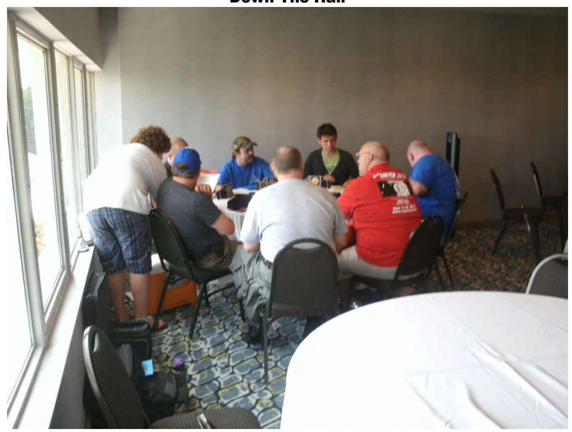
And All Over The 6th Floor