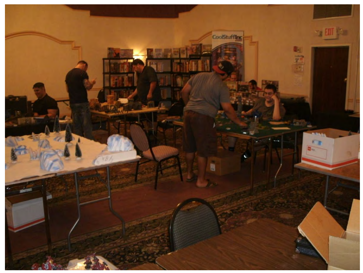
Sunday Morning The Games Went On