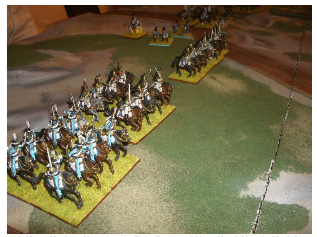
A More Modern Napoleonic Epic Featured New Hard Plastic Models