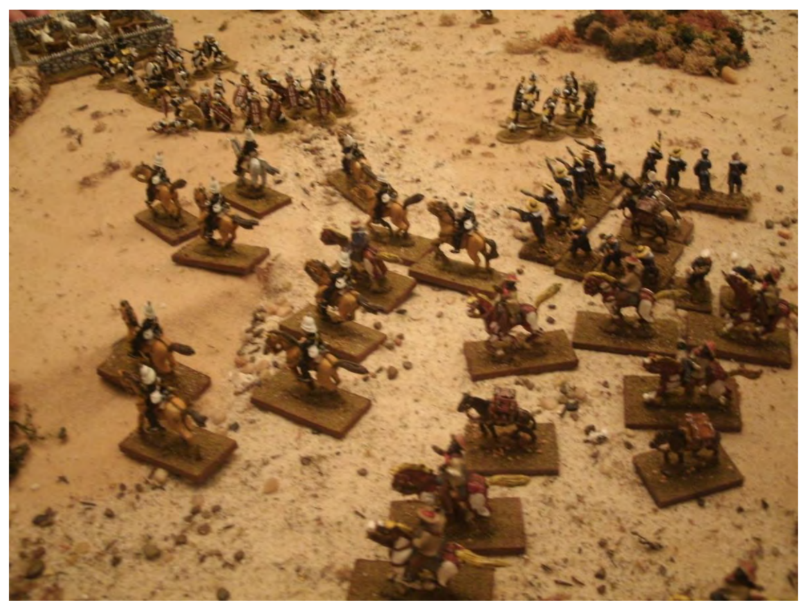
Relief Of Roark's Drift