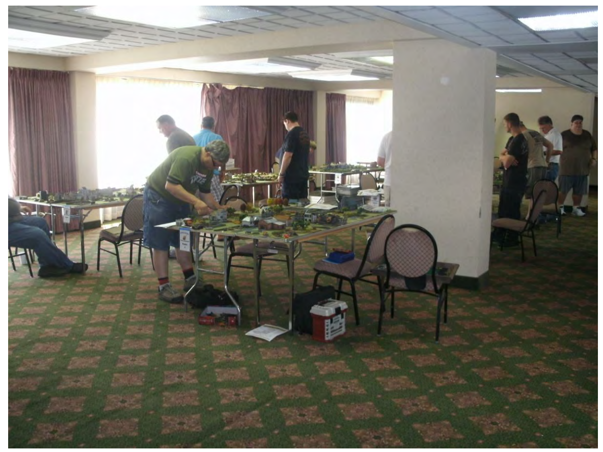
Meanwhile The FOW Tournament Was Held In The Original Site