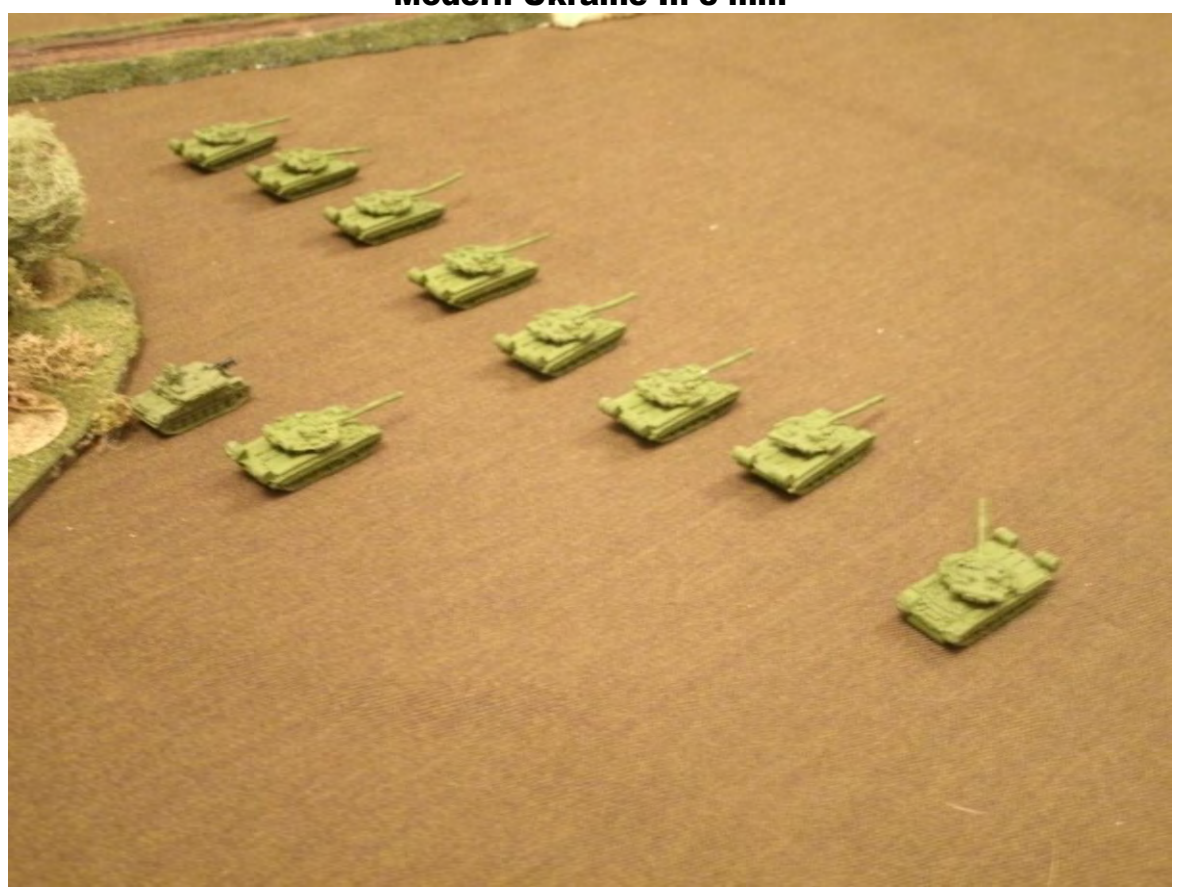
Pretty Good for 3mm Models