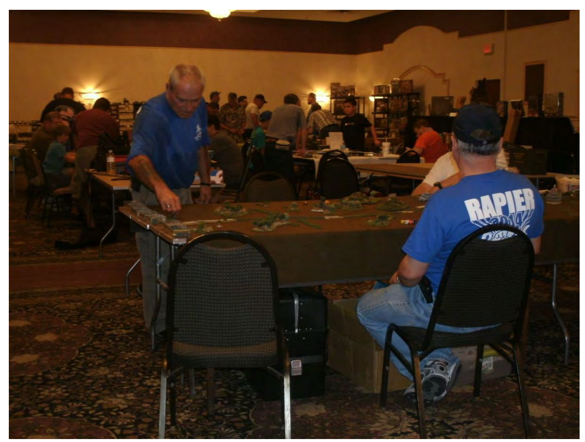
Modern Ukraine In 3 mm