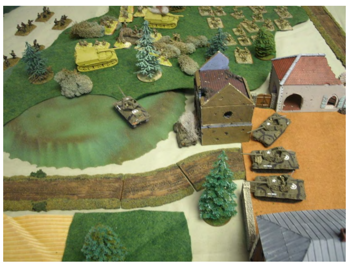
U.S. Tank Destroyers In Action