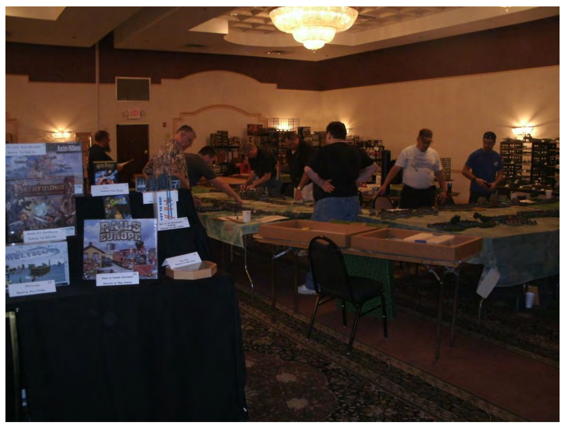
Of Course My Favorites Were The Traditional Historical Minis