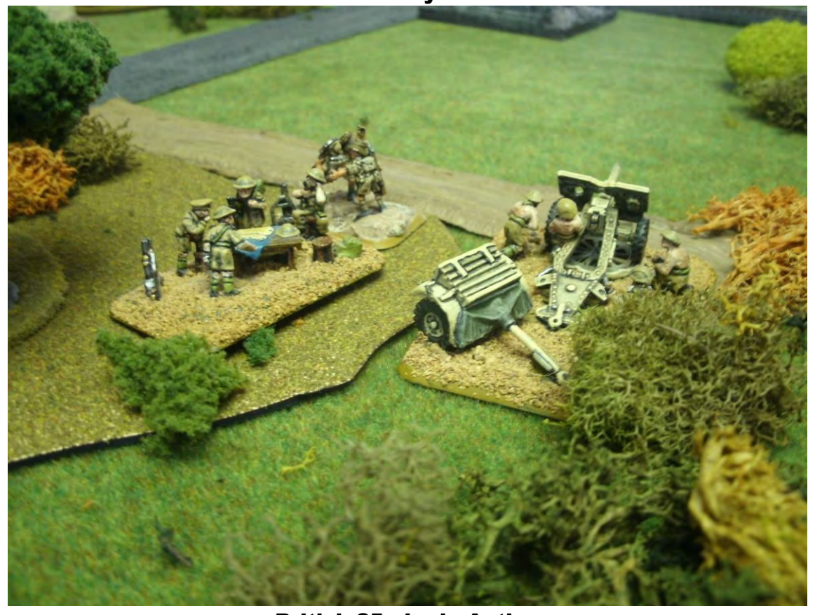
British 25pdrs in Action