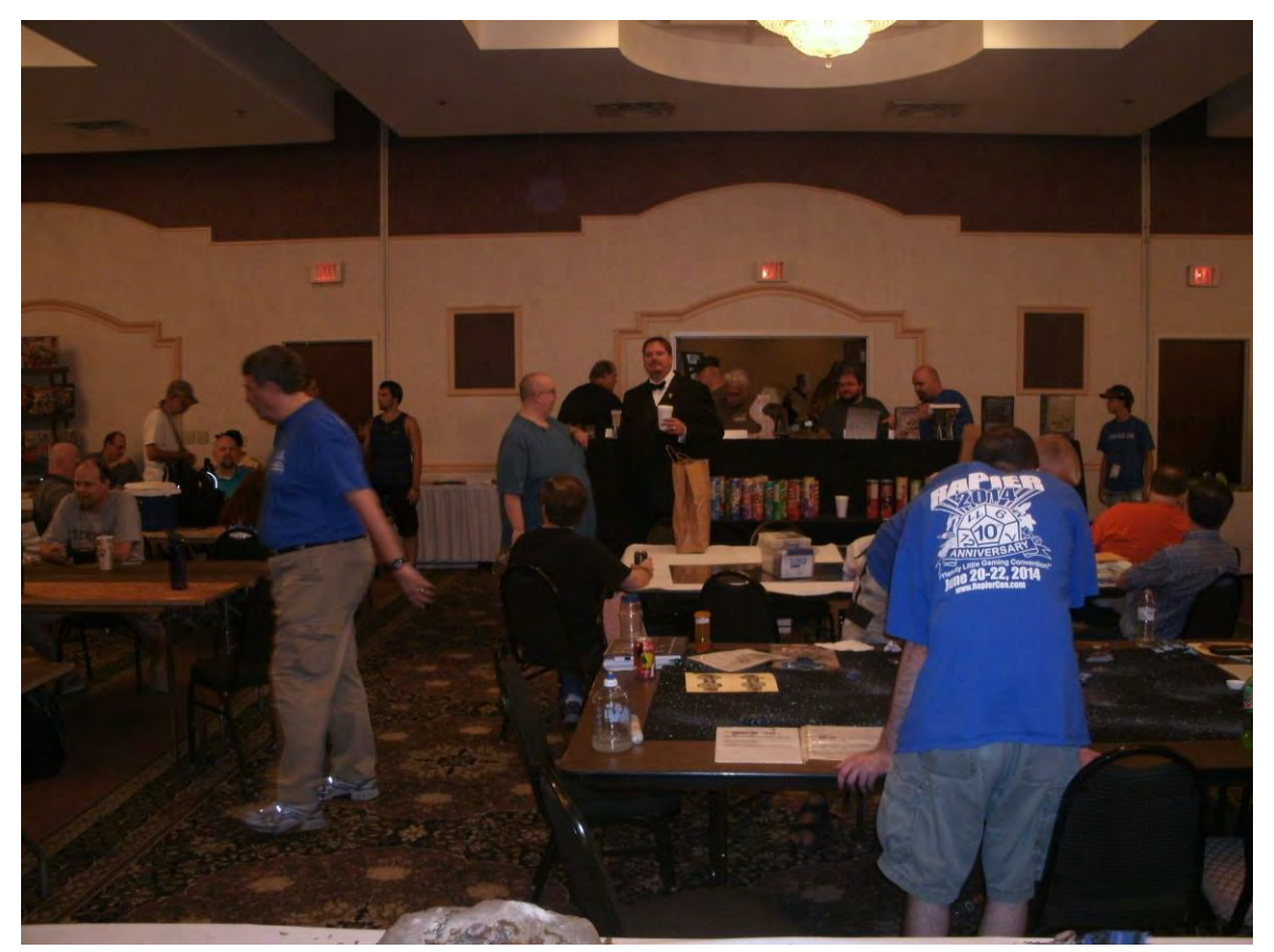
Time Out For The Saturday Night Raffles