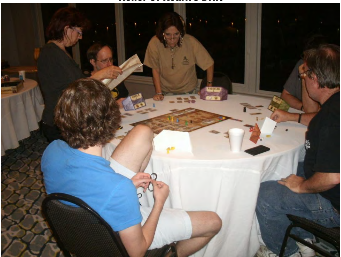
While Upstairs the Board Gamers Played Well Into The Night