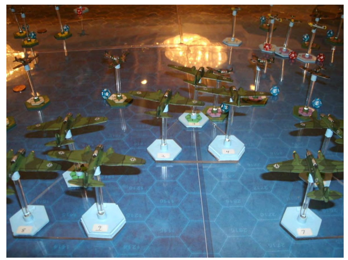
One of Several WWII Air War Games-Battle of Britain