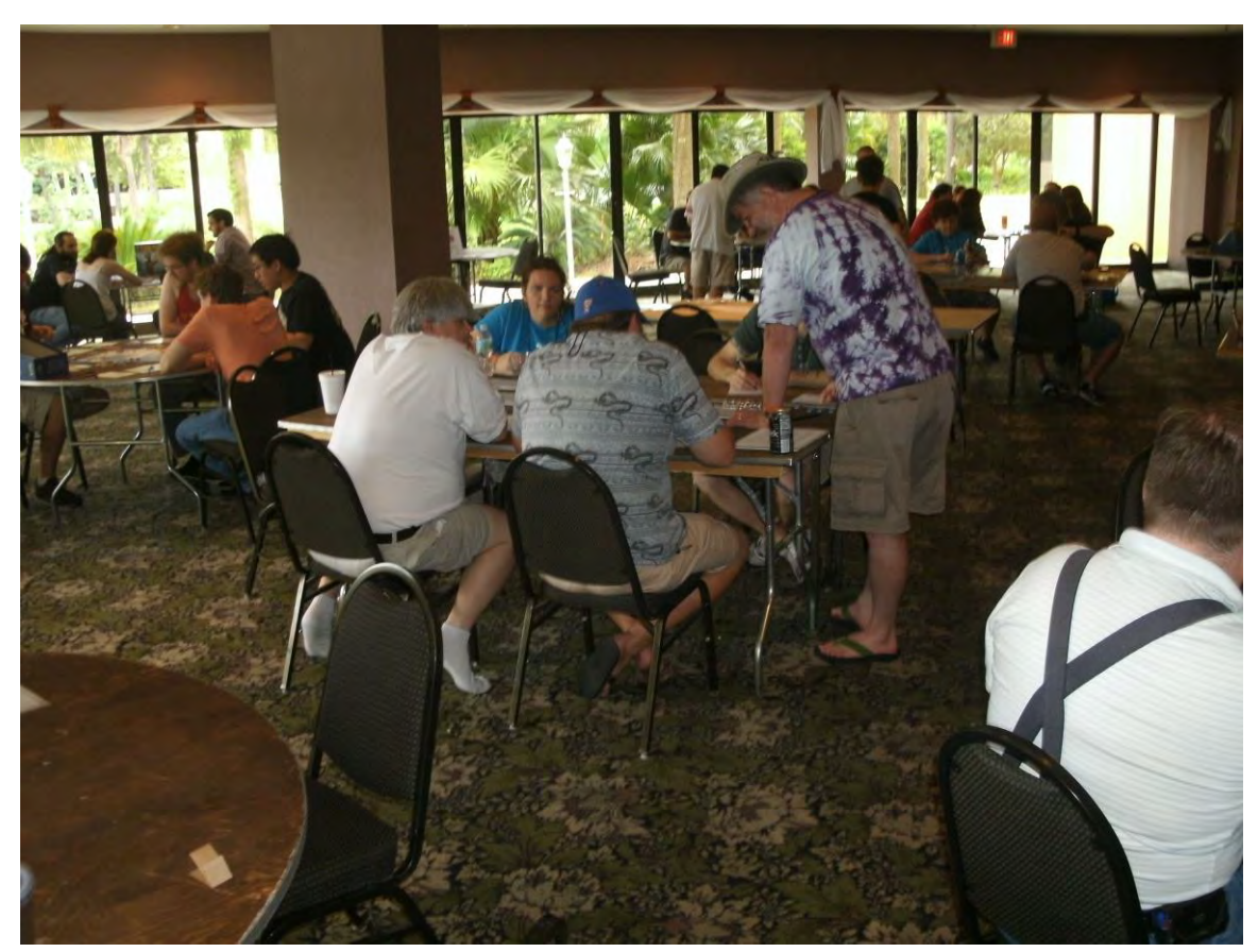
Last Year's Board Games In The Restaurant Area