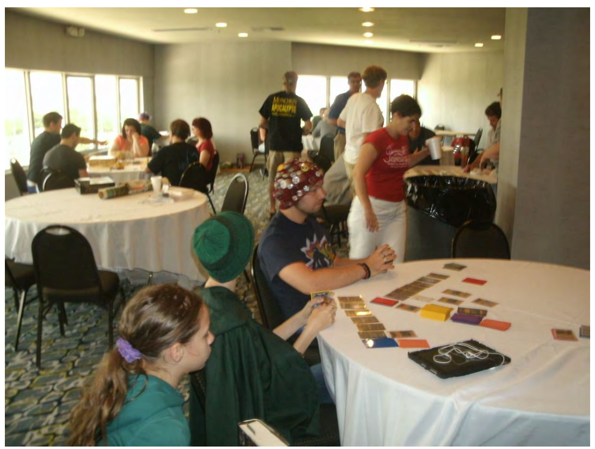
Sunday Morning On The 6th Floor

The 10<sup>th</sup> Anniversary of RAPIER has come and gone. It was a lively convention with enough gamers for the games and games for the gamers. There were events for most facets of the hobby. But attendance was less than it had been, and almost certainly less than we will see next year.