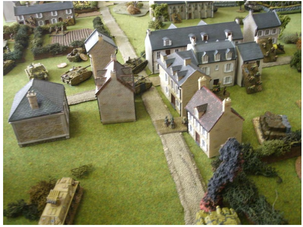
FOW Action At RAPIER 2014