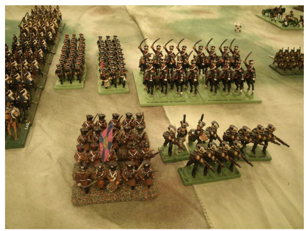
An Epic CLS Game Ran ForMost Of RAPIER 2014