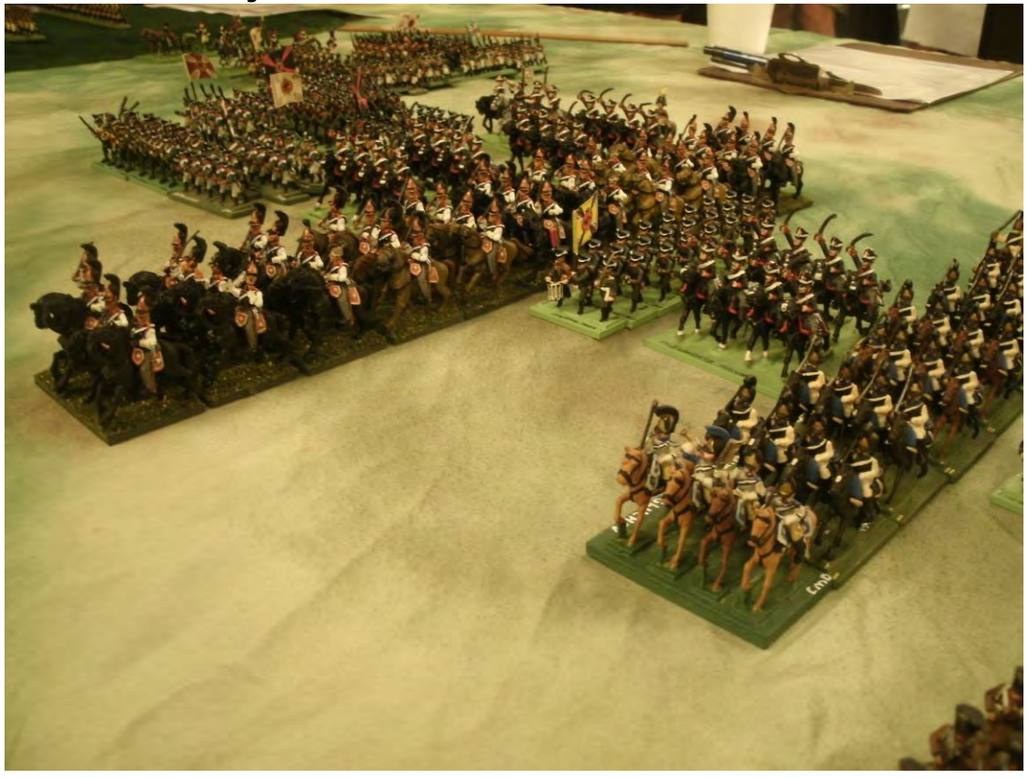
And You Can't Get More Traditional Than Column Line And Slaughter