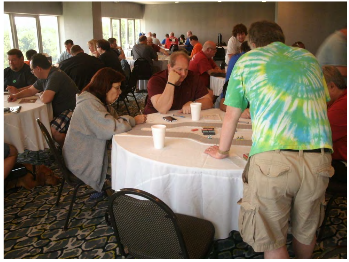
This Year's Largest Board Game Area on the 6th Floor