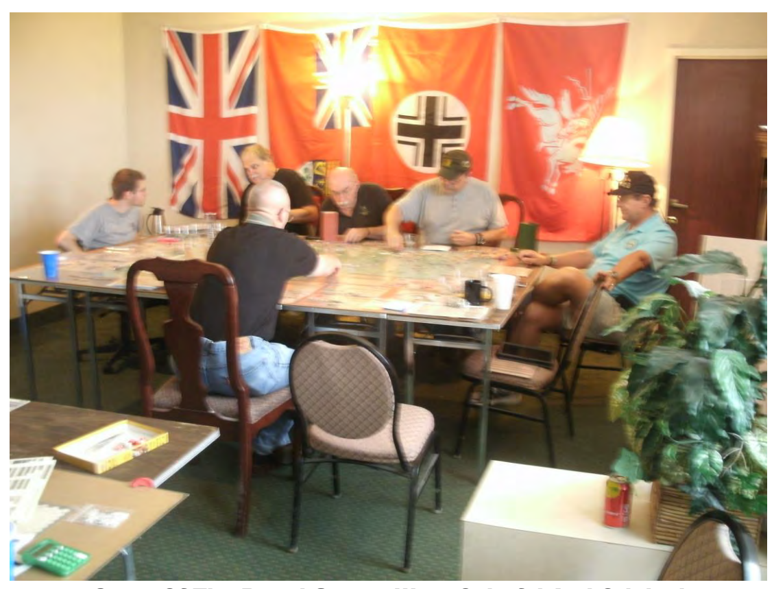
Some Of The Board Games Were Colorful And Original